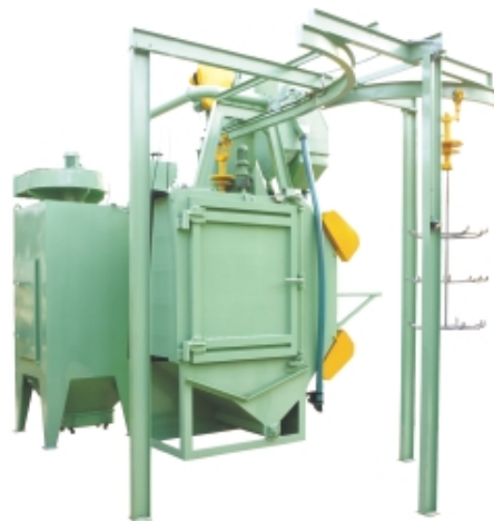
Y-CONVEYOR HANGER TYPE SHOT BLASTING MACHINE

HANGER TYPE SHOT BLASTING & PEENING MACHINE SMOOTH COMPLEXION FOR METAL SURFACE